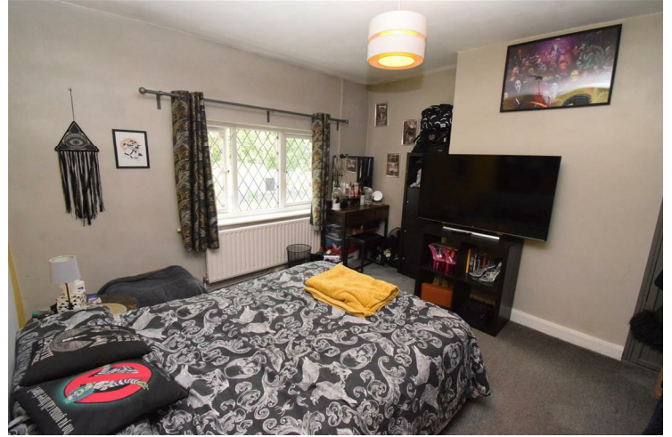
Bedroom 1 12'6" x 12'0" max. (3.82 x 3.67 max.)

Front double bedroom with a leaded light double glazed front window with a pleasant view over Jubilee Park. A fitted wardrobe, radiator and access to the loft space.