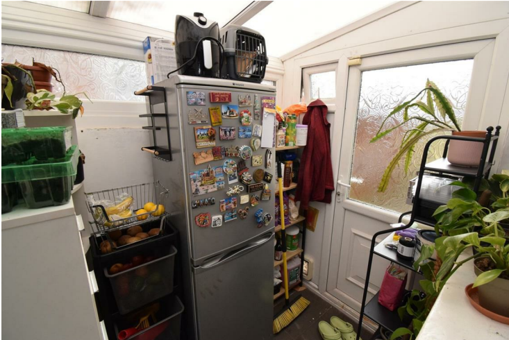
Rear Porch 6'6" x 4'9" (2.00 x 1.45)

Useful storage area with tiled flooring, double glazed windows and door opening to the rear yard/garden.