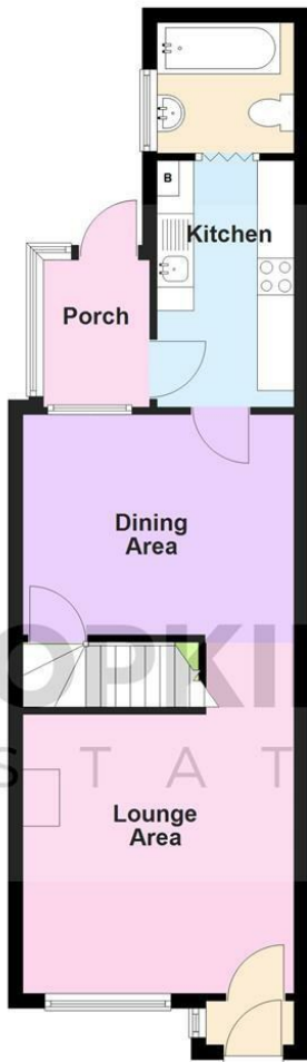
Ground Floor Approx. 42.8 sq. metres (460.3 sq. feet)