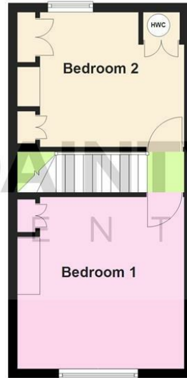
First Floor Approx. 29.1 sq. metres (313.5 sq. feet)