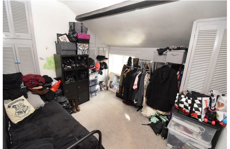
Bedroom 2 12'2" x 9'11" max. (3.71 x 3.04 max.)

Rear double bedroom with two fitted wardrobes, a further airing cupboard housing the hot water cylinder, radiator, part sloping ceiling with a beam and double glazed rear window.