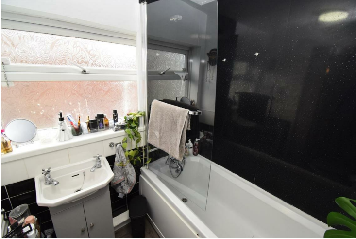
Bathroom 6'2" x 5'10" (1.90 x 1.78)

Three piece suite comprising bath with a shower attachment and screen; wash hand basin and a WC. Tiled splashbacks, a radiator and double glazed side window.